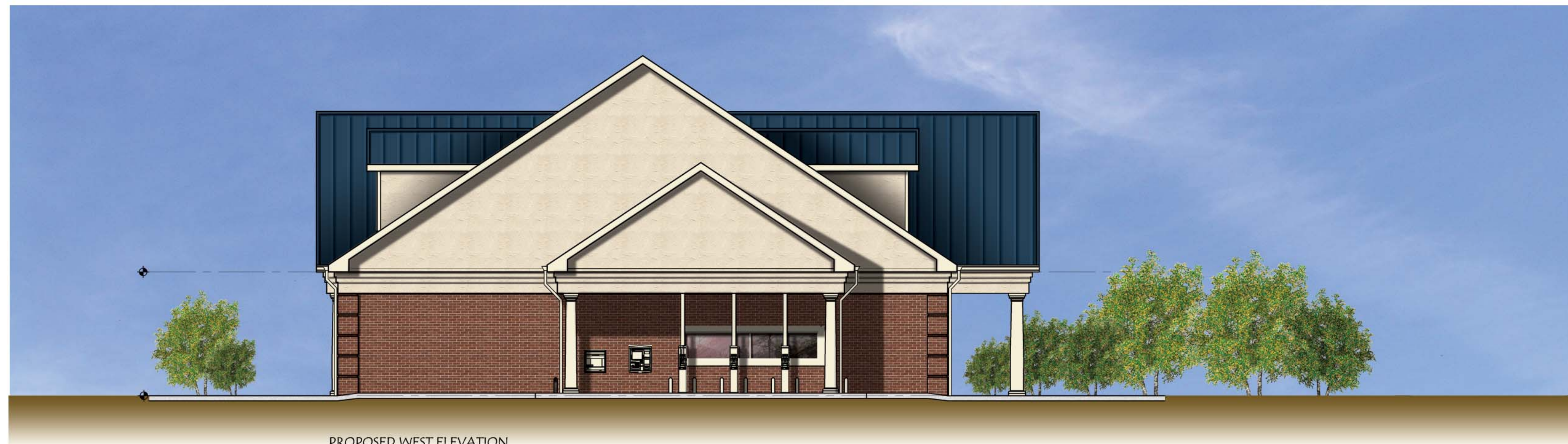
PROPOSED WEST ELEVATION 3/16" = 1'-0"