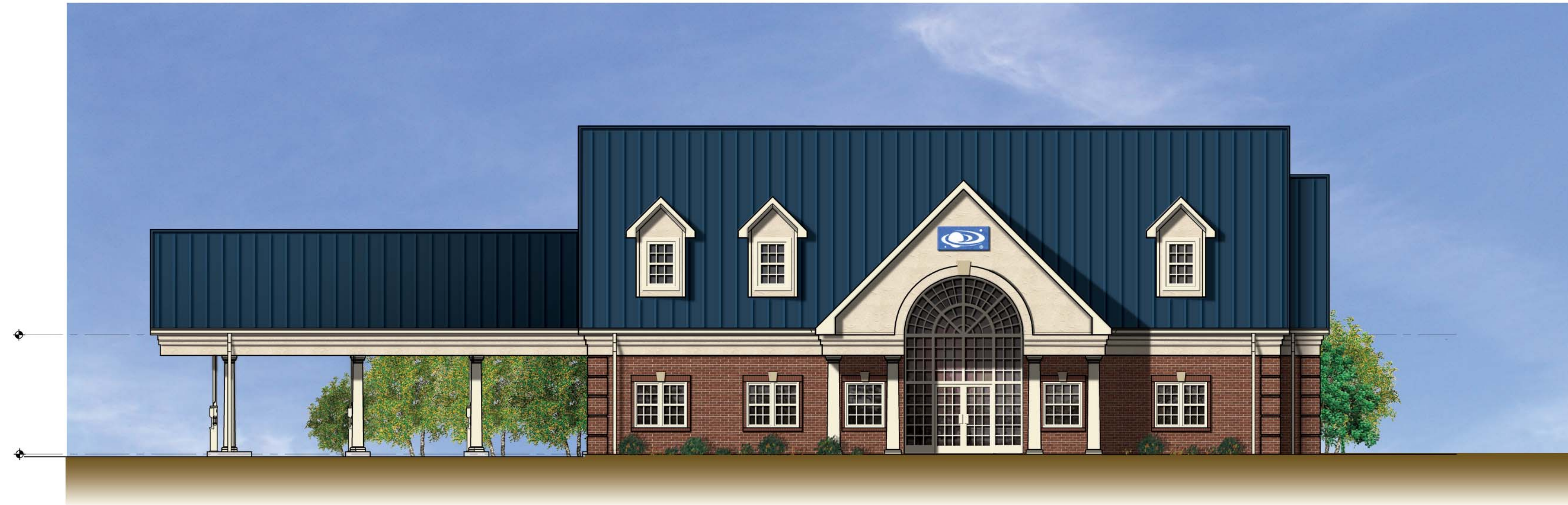
PROPOSED NORTH ELEVATION 3/16" = 1'-0"