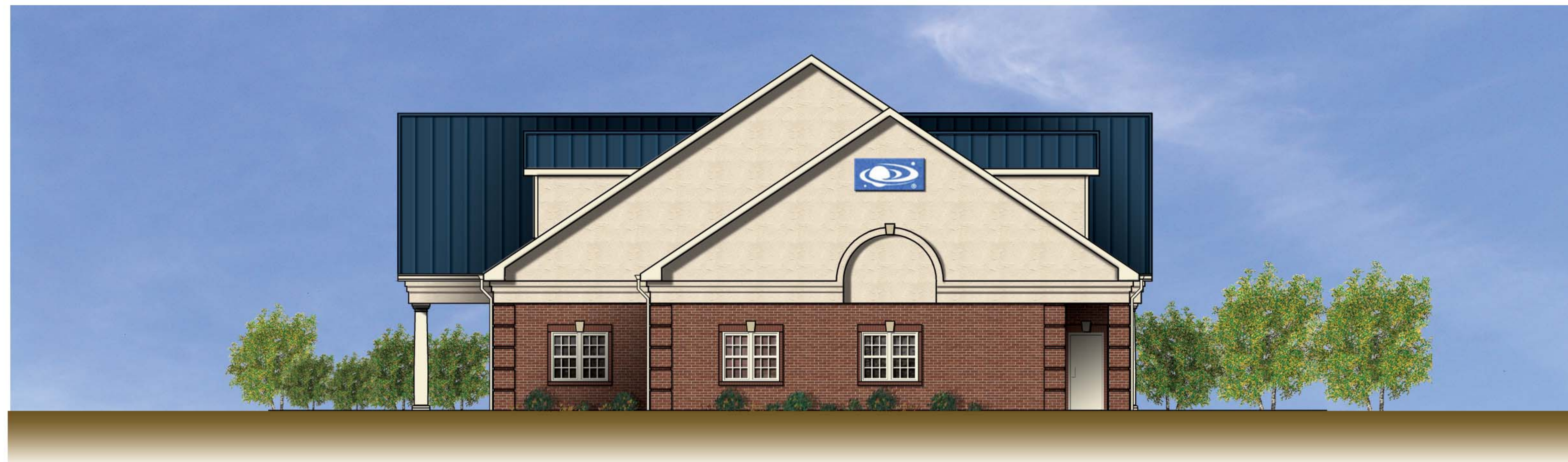
PROPOSED EAST ELEVATION 3/16" = 1'-0"