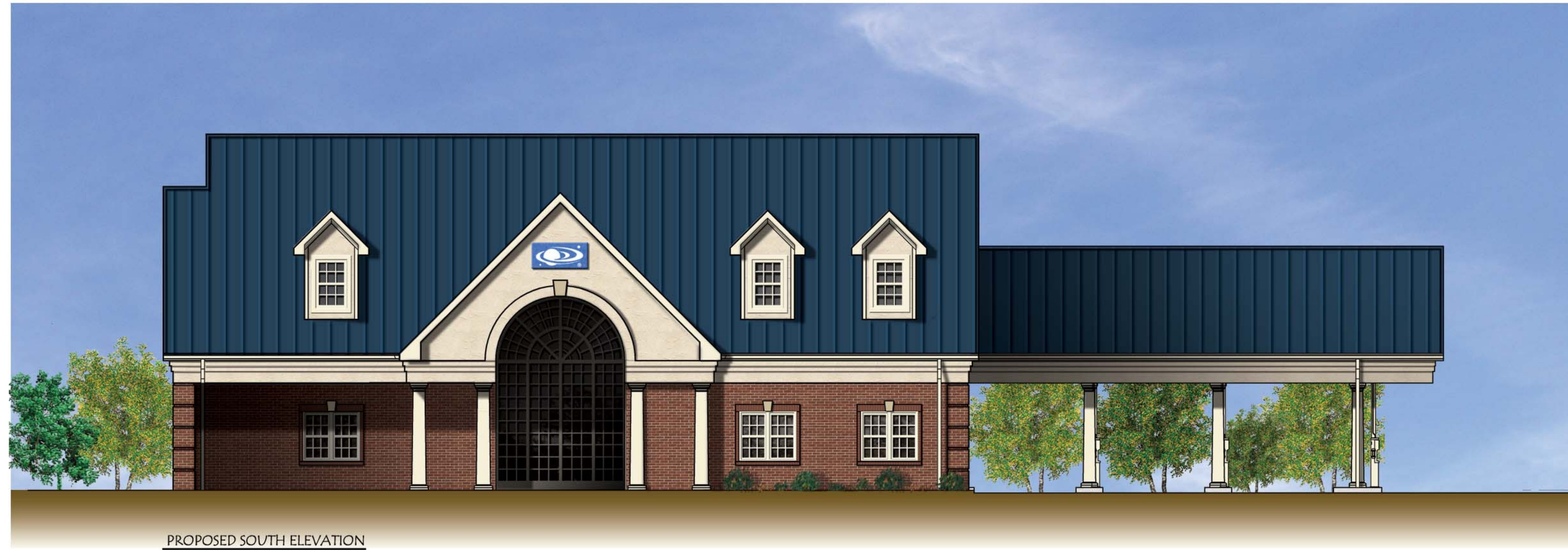
PROPOSED SOUTH ELEVATION 3/16" = 1'-0"